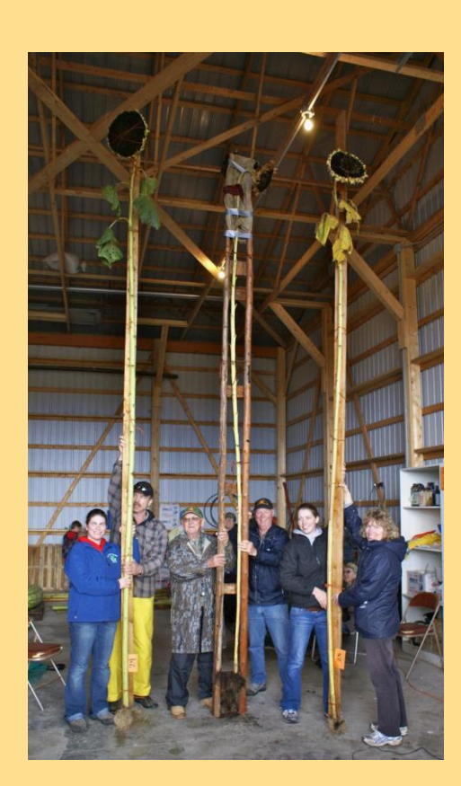
Tall Sunflowers at Wellington Pumpkinfest 2011