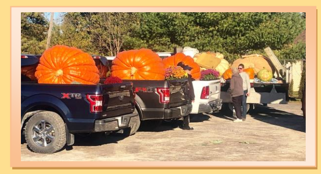
885 Langridge 19 est, 888.5 Langridge 19, 804.5 Langridge EXH 19